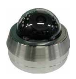
CC06-TD12VF-X HDTVI Dome Camera 2.8-12mm Lens