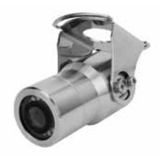
CC06-HBU36F-K Analog Underwater Bullet Camera 3.6mm Lens