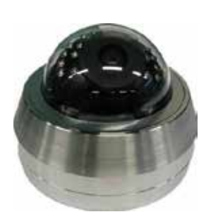
CC06-ND12VF IP Network Dome Camera 2.8-12mm Lens