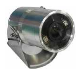
CC06-TB12VF-M HDTVI Bullet Camera 2.8-12mm Lens