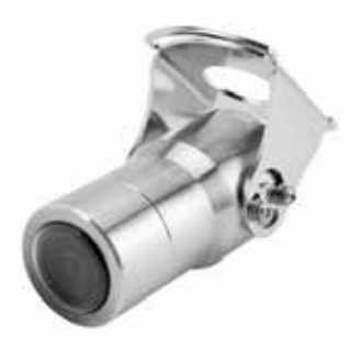
CC06-HB23F Analog Bullet Camera 2.3mm Lens