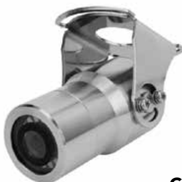
CC06 Stainless Steel Series IP Network, HDTV, Analog