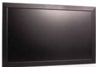
LCDI-215HDM Industrial 21.5" Monitor