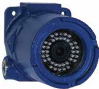
CC03-IP2MVFIR Explosion Proof Network Camera