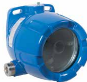
CC03-1F Explosion Proof Analog Camera