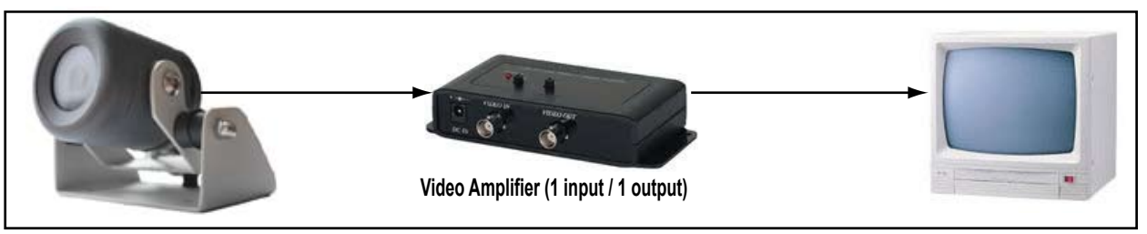
Diagram 1: Example of Video Amplifier Installed to Boost Signal to Remote Monitor

Coaxial cables are designed to transmit video signals from a 75 ohm source (the standard for CCTV cameras) with minimum signal loss. However signal loss (also known as attenuation) is inevitable and increases in proportion to the length and size of the cable used. In other words, the smaller the diameter of the cable, the greater the loss will be. Video loss is also increased at each connection point along the system. A video signal transmitted from a camera to a monitor 1,000 feet away will lose roughly 35 to 40 percent of the information sent. As a result the degraded image quality on the monitor will not reflect the true capability of the camera or the monitor.